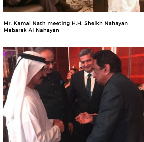
Mr. Kamal Nath meeting H.H. Sheikh Nahayan Mabarak Al Nahayan

A high-level Government of Madhya Pradesh delegation led by Mr. Kamal Nath, Hon'ble Chief Minister participated in Asia Business Leadership Forum (ABLF) in Dubai from 5 th to 7 th November. Government of Madhya Pradesh delegation participated in ABLF Awards as well as convened various one to one business meetings with Dubai-based business leaders. Established in 2007, the ABLF is held under the patronage of H.H. Sheikh Nahayan Mabarak Al Nahayan, Cabinet Member and Minister of Tolerance, UAE, and is recognised by the UAE Federal Government through a long term partnership with the UAE Ministry of Economy.