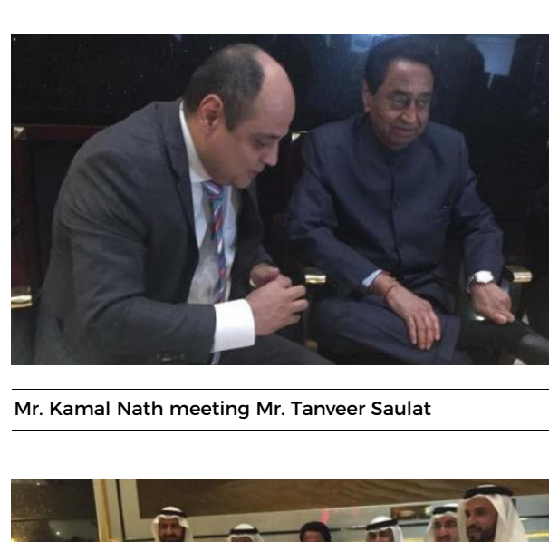
Mr. Kamal Nath meeting H.H. Sheikh Nahayan Mabarak Al Nahayan